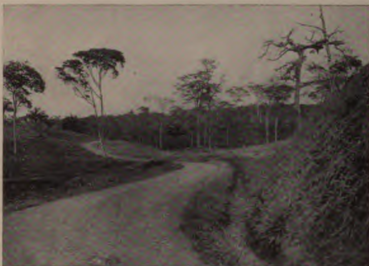
The winding back road between the two surviving Gatuns